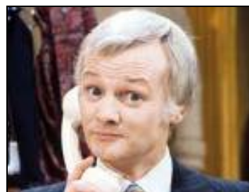
John Inman as Mr. Humphries

Are You Being Served? began life as part of the BBC's Comedy Playhouse strand. But disruption to the 1972 Munich Olympics meant it was moved to fill gaps in the prime time schedule.